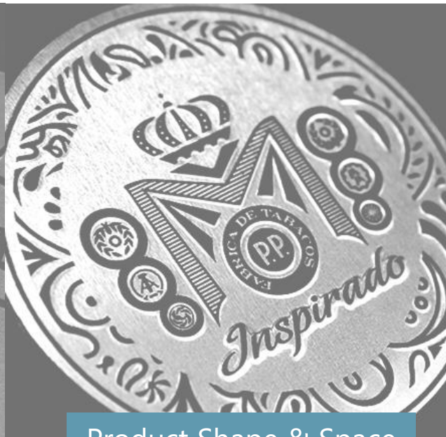
Product Shape & Space