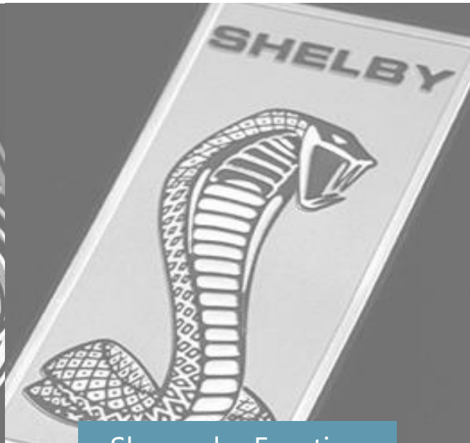
Shapes by Emotion