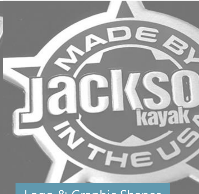
Logo & Graphic Shapes