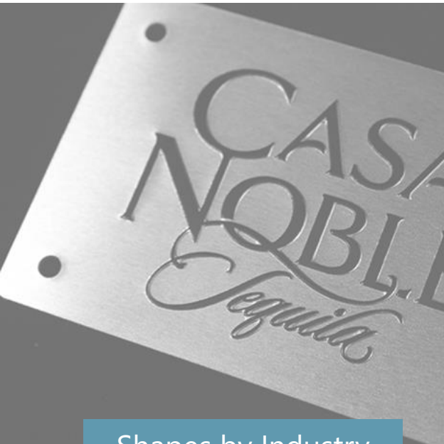
Shapes by Industry

To choose the best nameplate shape for your product, consider your product and the message you want to convey. To do that, look at four basic considerations.